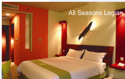
All Seasons Legian