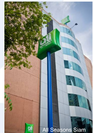
All Seasons Siam