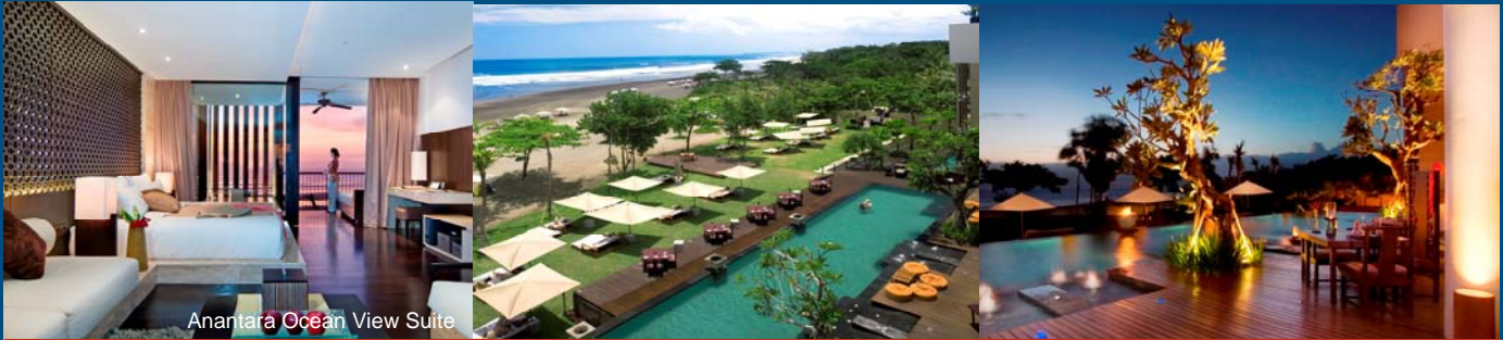
Anantara Ocean View Suite