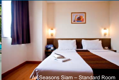
All Seasons Siam – Standard Room