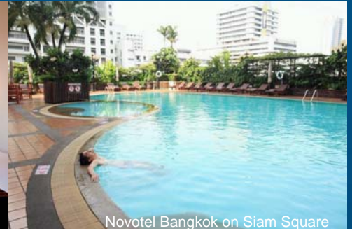
Novotel Bangkok on Siam Square