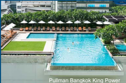
Pullman Bangkok King Power