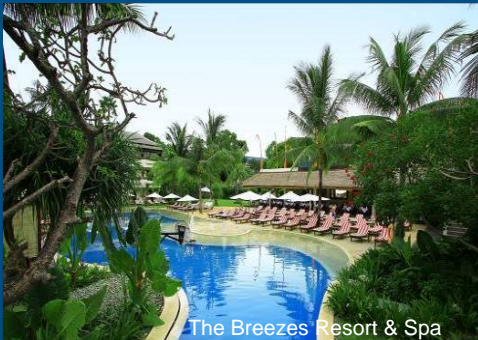
The Breezes Resort & Spa