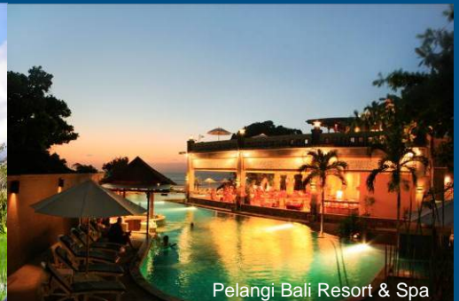
Pelangi Bali Resort & Spa