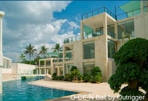
O-CE-N Bali by Outrigger