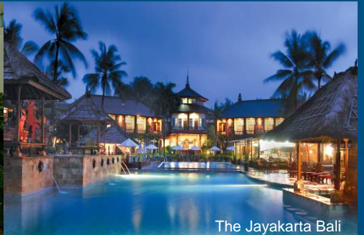
The Jayakarta Bali