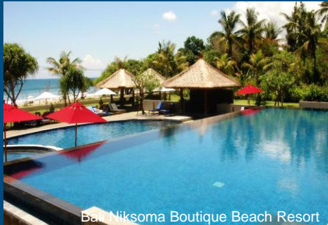
Bali Niksoma Boutique Beach Resort