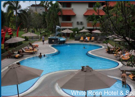
White Rose Hotel & Spa