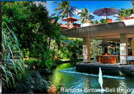
Ramada Bintang Bali Resort