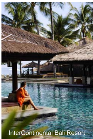
InterContinental Bali Resort