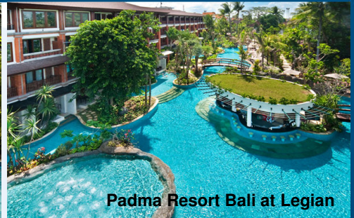
Padma Resort Bali at Legian