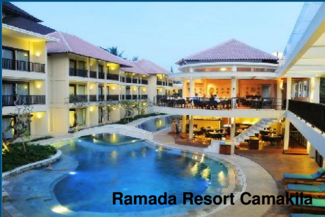
Ramada Resort Camakila