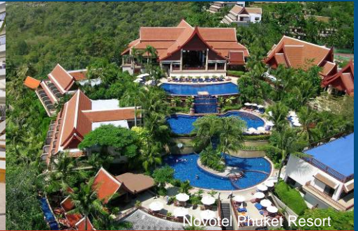
Novotel Phuket Resort