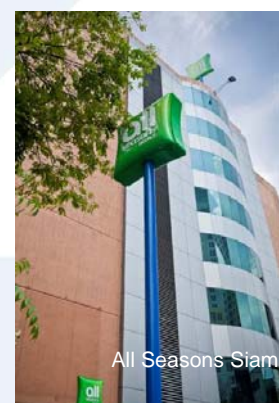
All Seasons Siam

CONDITIONS: Valid for Sale until: 15Aug10. Prices are per person based on 2 adults sharing the cost of accommodation. ^ Saving calculation of 20% per person is the max saving based on Year Round THAI "W" class airfare, 16Jul-16Sep10.*Room credit offer is credited to room account and can be used for all services in the hotel. The credit can not be used against your room rate and is not redeemable for cash. Surcharges apply for travel outside of the above dates. Ticketing conditions apply. Book TG Intl "W" class, Dom. 'H' class. Taxes and prices are correct as at 28Jun10, subject to change without notice & subject to availability. Taxes are based on the most direct routing & will vary depending on routing booked. Extra nights may be required due to flight schedules and are at the passengers own expense. Prices do not include taxes or charges collected directly by third parties. Please note a surcharge may be imposed on credit card transactions. Conditions apply & subject to availability. For current information on travelling overseas and official Government travel advisories visit www.smarttraveller.gov.au Travel agent service fees may apply and vary by agency. Please ask at time of enquiry.