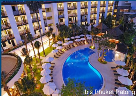
Ibis Phuket Patong