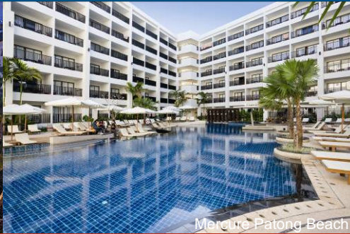
Mercure Patong Beach