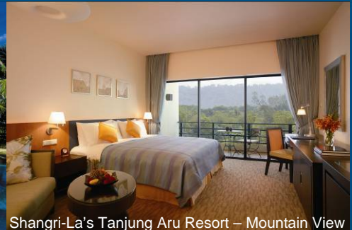
Shangri-La's Tanjung Aru Resort - Mountain View