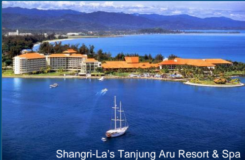
Shangri-La's Tanjung Aru Resort & Spa