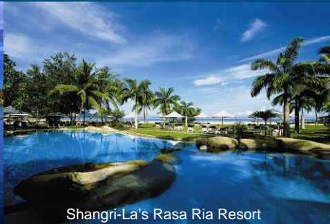
Shangri-La's Rasa Ria Resort