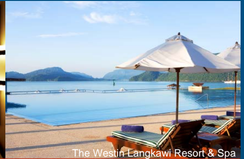
The Westin Langkawi Resort & Spa