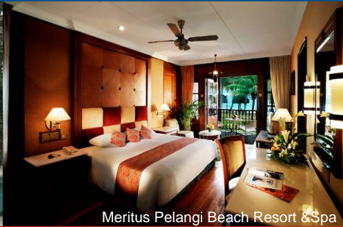
Meritus Pelangi Beach Resort & Spa