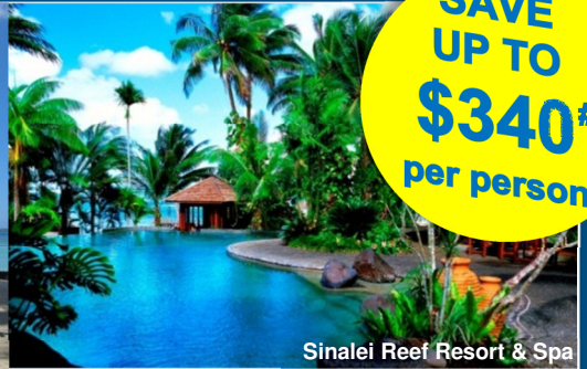
Sinalei Reef Resort & Spa