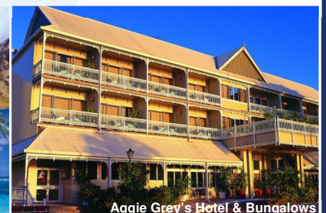
Aggie Grey's Hotel & Bungalows