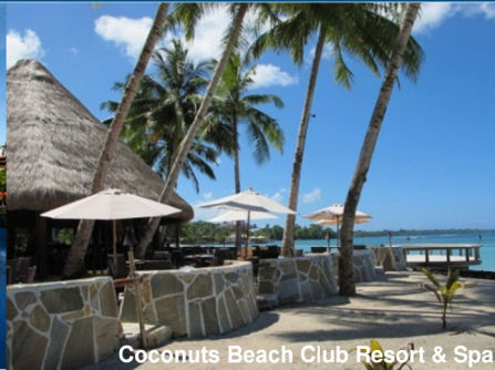
Coconuts Beach Club Resort & Spa