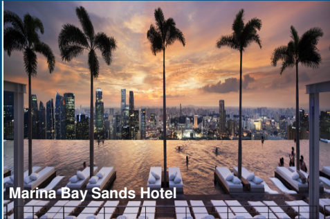
Marina Bay Sands Hotel