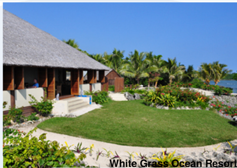
White Grass Ocean Resort