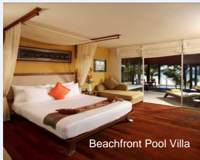
Beachfront Pool Villa