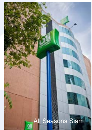
All Seasons Siam

CONDITIONS: Valid for Sale until: 31Aug10. Prices are per person based on 2 adults sharing the cost of accommodation. *Room credit offer is credited to room account and can be used for all services in the hotel. The credit can not be used against your room rate and is not redeemable for cash. Surcharges apply for travel outside of the above dates. Ticketing conditions apply. Book TG Intl "W" class, Dom. 'H' class. For departures ex ADL. Book DJ 'E' class to MEL. Taxes and prices are correct as at 22Jun10, subject to change without notice & subject to availability. Taxes are based on the most direct routing & will vary depending on routing booked. Extra nights may be required due to flight schedules and are at the passengers own expense. Prices do not include taxes or charges collected directly by third parties. Please note a surcharge may be imposed on credit card transactions. Conditions apply & subject to availability. For current information on travelling overseas and official Government travel advisories visit www.smarttraveller.gov.au