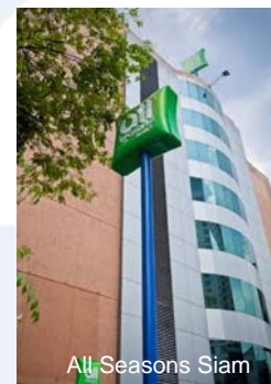
All Seasons Siam

CONDITIONS: Valid for Sale until: 15Aug10. Prices are per person based on 2 adults sharing the cost of accommodation. ^ Saving calculation of 25% per person is the max saving based on Year Round THAI "W" class airfare, 16Jul-16Sep10. *Room credit offer is credited to room account and can be used for all services in the hotel. The credit can not be used against your room rate and is not redeemable for cash. Surcharges apply for travel outside of the above dates. Ticketing conditions apply. Book TG Intl "W" class, Dom. 'H' class. Taxes and prices are correct as at 28Jun10, subject to change without notice & subject to availability. Taxes are based on the most direct routing & will vary depending on routing booked. Extra nights may be required due to flight schedules and are at the passengers own expense. Prices do not include taxes or charges collected directly by third parties. Please note a surcharge may be imposed on credit card transactions. Conditions apply & subject to availability. For current information on travelling overseas and official Government travel advisories visit www.smarttraveller.gov.au Travel agent service fees may apply and vary by agency. Please ask at time of enquiry.