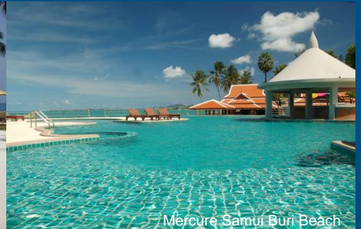
Mercure Samui Buri Beach