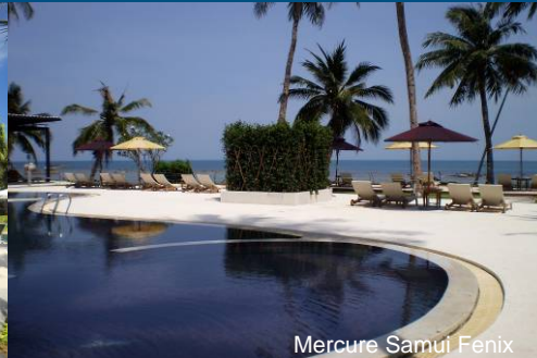
Mercure Samui Fenix